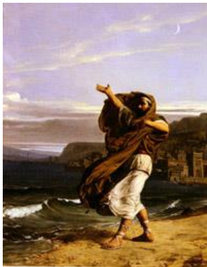
Demosthenes Practising Oratory (1870)

Your class Project is your Term Paper, plus a short “work-in-progress” presentation.