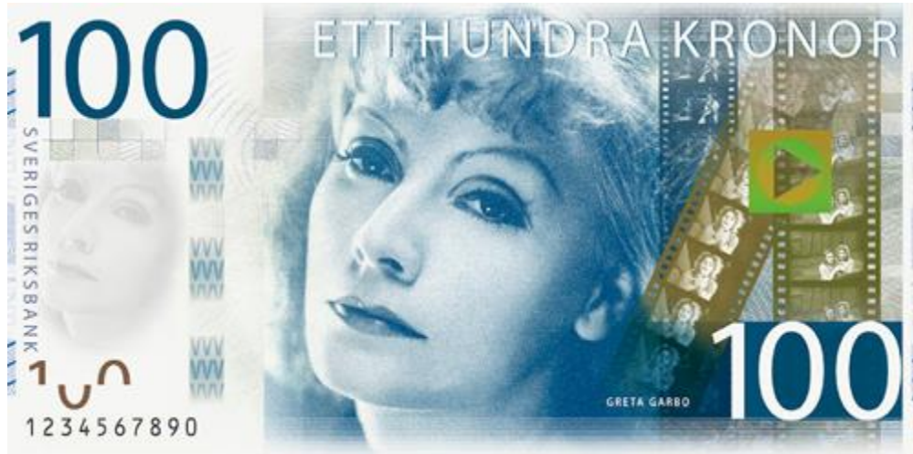
Actress Greta Garbo