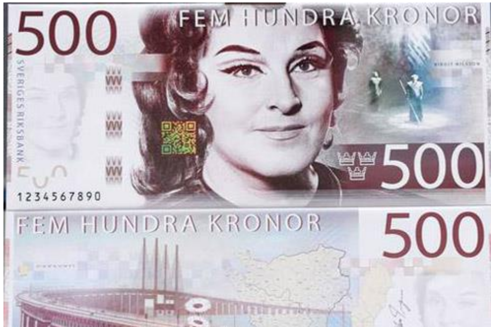
Opera Singer Birgit Nilsson