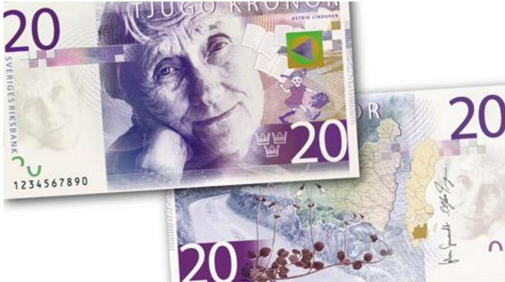
Pippi Longstocking Author Astrid Lindgren